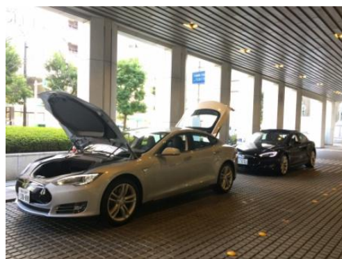
Test cars on display