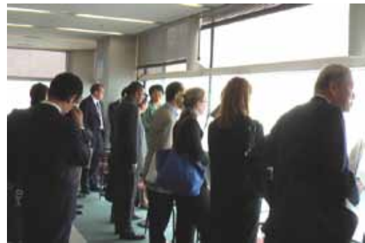
Participants (at WTC) looking down on Osaka Bay